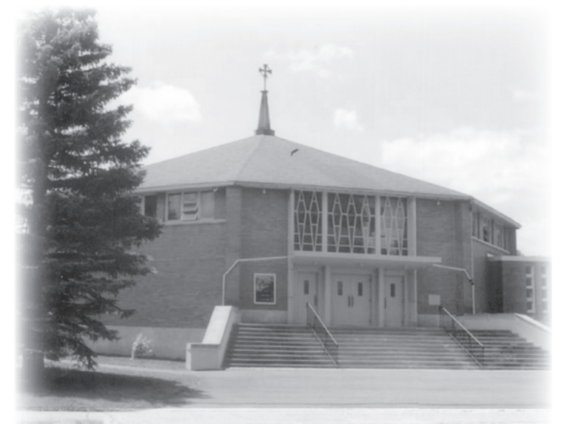
A dynamic Catholic community called by the Risen Lord to share God's love through worship, service and solidarity.